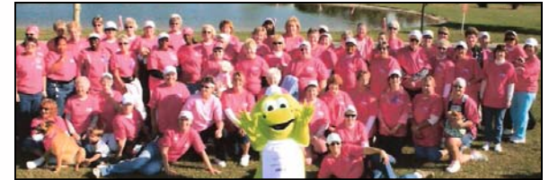
Our Annual Walk For Awareness